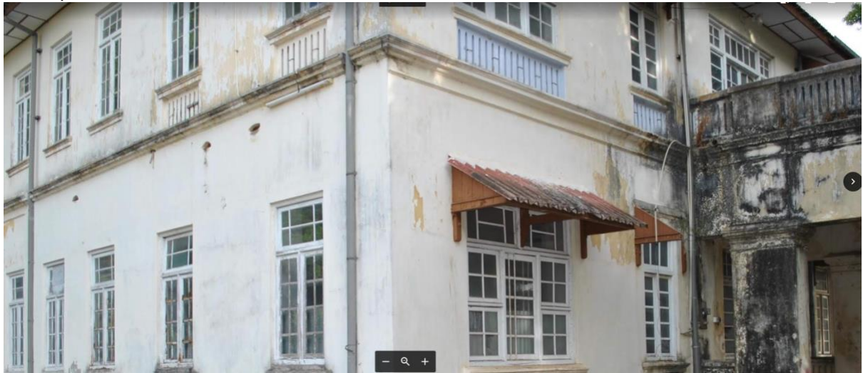
Pre repair Jameson Block