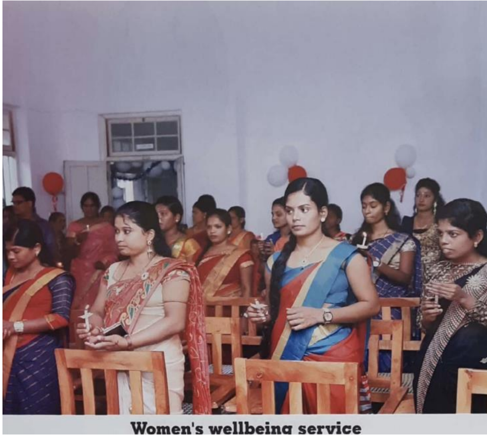
Women's wellbeing service

The ultrasound machine is used by Gynaecologists and radiologists